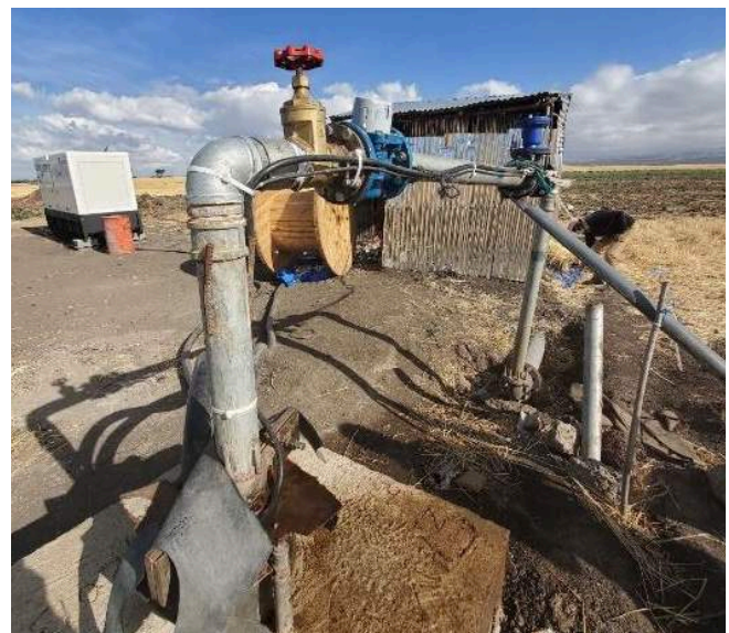
WATER WELL 03

Drilling of our water wells are still ongoing with their challenges. Well 03 has been serving the geothermal drilling needs for the past 2 months. We are hoping to get water from one of our wells by the end of this month.